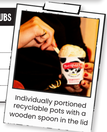
Individually portioned recyclable pots with a wooden spoon in the lid

Made with Marc de Champagne & juicy strawberries