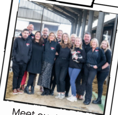
Meet our team of friendly reps

From freezer support to customer branding, to scoop training and upselling ideas, our team really do have the inside scoop!