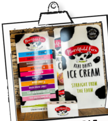
POINT OF SALE Flip to the end for more information

Made with Marc de Champagne & juicy strawberries