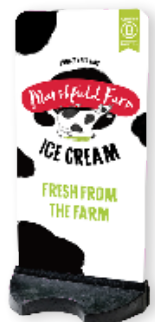
Classic Pavement Stand

CONTACT US FOR PRICES, ADDITIONAL POS AND FREEZER DEALS