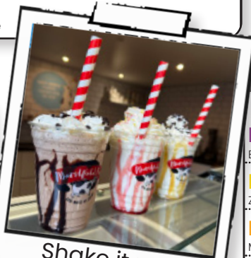
Shake it up! Ask your rep for upselling ideas