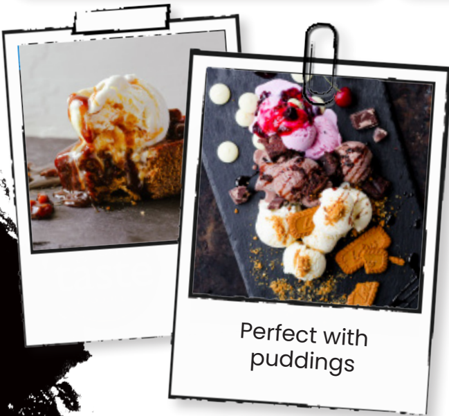
Perfect with puddings