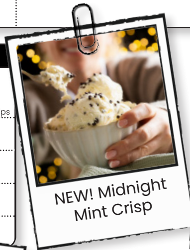
NEW! Midnight Mint Crisp