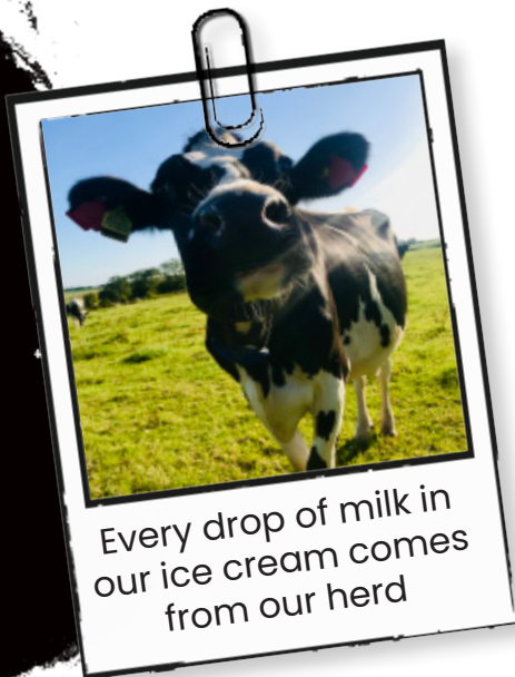
Every drop of milk in our ice cream comes from our herd