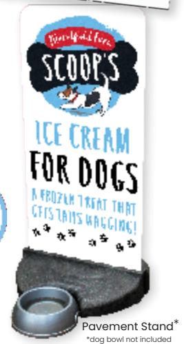
Pavement Stand* *dog bowl not included