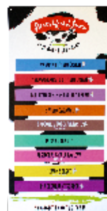
Magnetic Board & Flavour Strips

Freezer Deals Available (For more information, please see our 2024 Freezer Brochure)