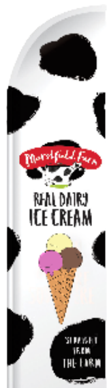
Classic Sail Flag (Large, 3.5m)

Exclusive to Marshfield Farm customers, please talk to your Sales Manager to gain online access.