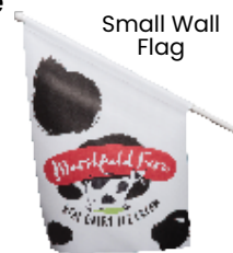
Small Wall Flag